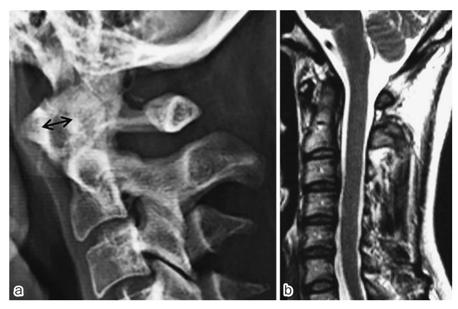
Figure 1. Preoperative X-ray showing atlantoaxial subluxation in lateral view in flexion position (a). Preoperative sagittal view of MRI T2 weighted image showing no spinal stenosis or high-intensity signal in atlantoaxial level (b).