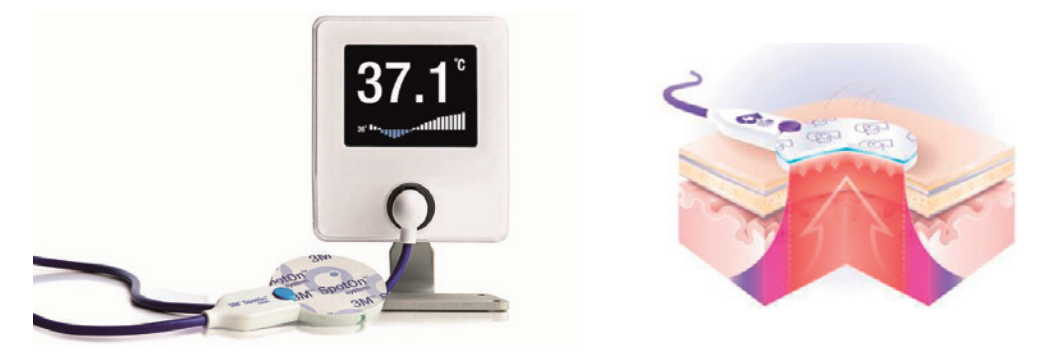
Figure 1 SpotOn<sup>TM</sup> system and zero-heat-flux (ZHF) technology. The thermal insulator and warming circuit are used to eliminate the flow of skin-surface heat to the environment, establishing conditions in which the temperature gradient should be zero between the thermistor on the skin surface of forehead and deep tissue. Core temperature rises the surface through isothermal pathway.

critically ill patients to predict mortality.<sup>3</sup>